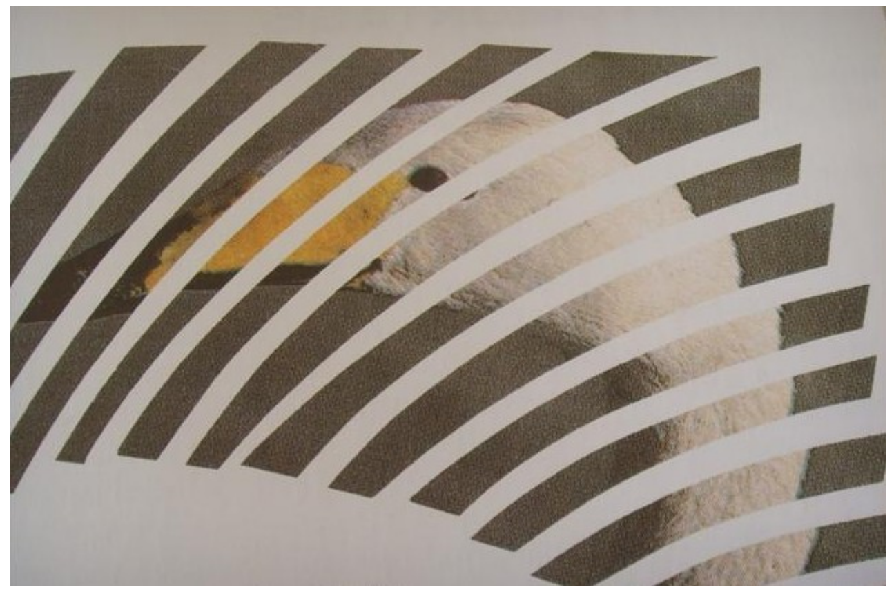
3- This image has been done using two pictures.