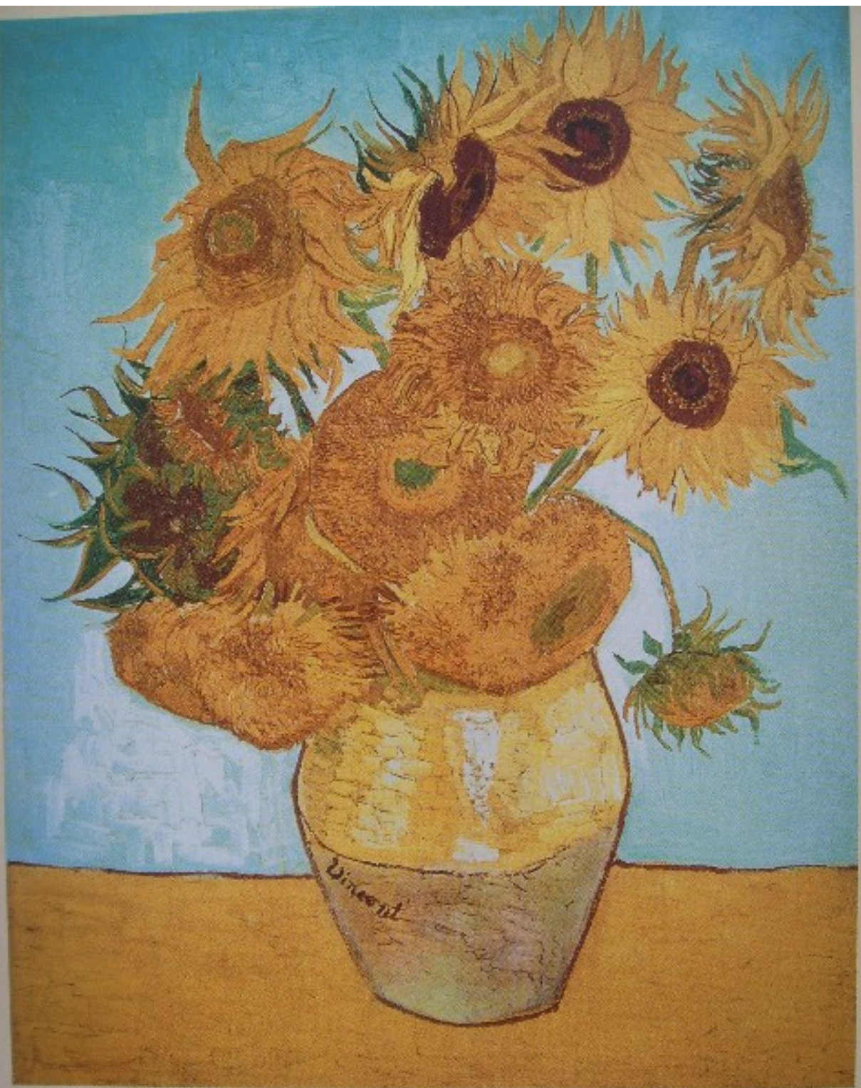
Van Gogh painted Sunflowers in 1888, using oil paints on canvas. He chose bright, modern paint colours, often applying paints straight from the tube. The picture measures 92 x 73cm (36 x 29in).