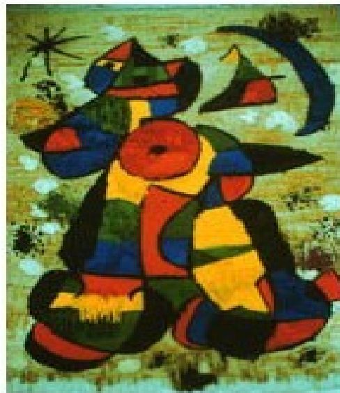
The Foundation Tapestry. 1979 Wool 750 x 500 cm.

Throughout his life, Joan Miró took a particular interest in the diversity of materials, forms and colours. It led him to explore and experiment with different art forms such as painting, sculpture, printing techniques, ceramics theatre and tapestry. In 1972 Joan Miró created his first textiles.