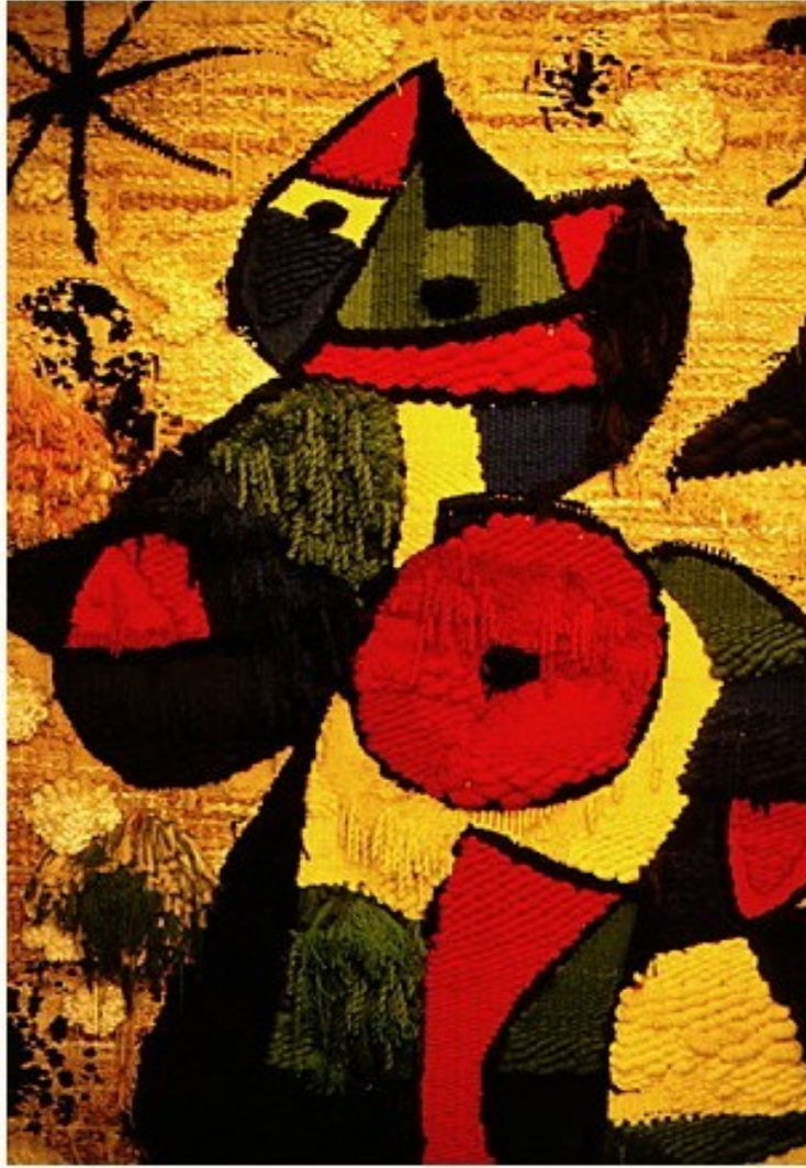
Colorful tapestry in Fondació Joan Miró museum in Montjuic park, Barcelona.