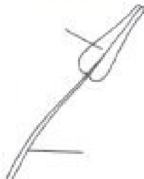
Parts of the stamen