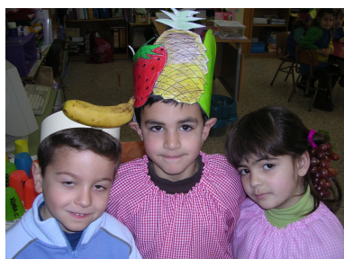
FRUITES AL CAP