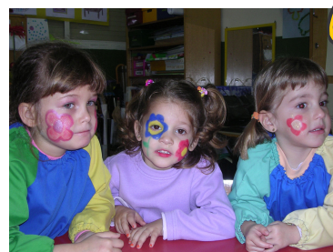
FLOR A LA CARA