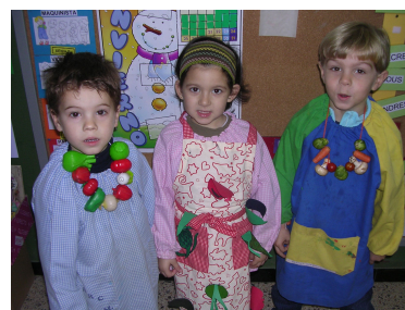
ENGALANAT DE VERDURES