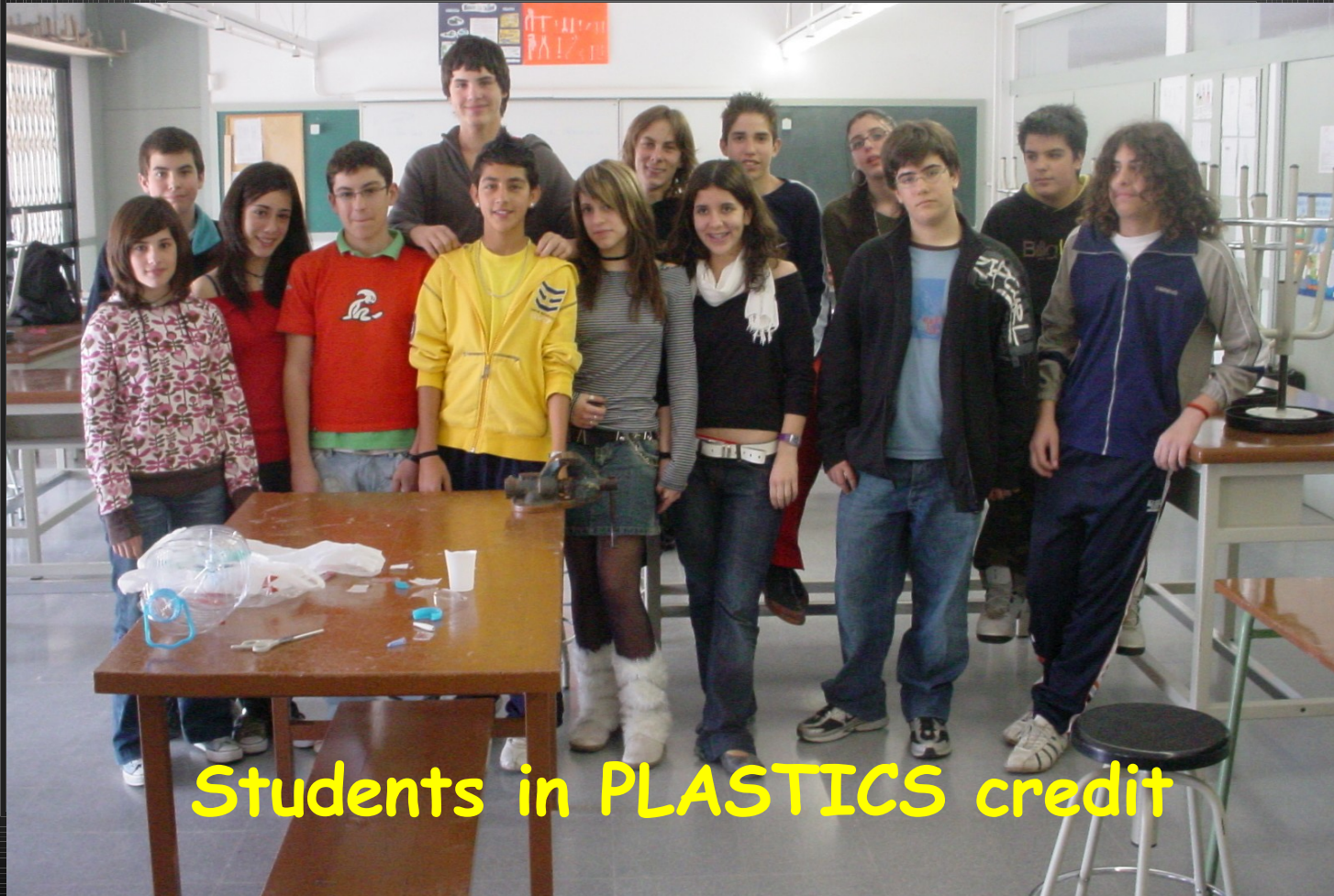
Students in PLASTICS credit