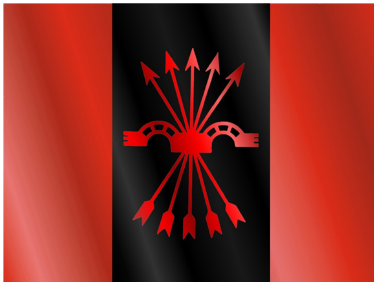
Falange Española's flag

The ideology of the new party defining the state (Falange Española Tradicionalista y de las JONS or Movimiento Nacional) was a mixture of elements from the more traditional right, which included carlists and monarchists and the ideology of the original Falange. They were anti-liberal, anti-socialist, used Spanish nationalism to confront Catalan and Basque nationalism, and, particularly the first two, defended a very conservative Catholicism. Falangists were closer to European fascism. Their influence on Franco's regime could be seen when adopting some policies inspired in Mussolini's Italy as the creation of the vertical union –conceived as union of workers and capitalists- where membership was compulsory (CNS). Other institutions also inspired in fascist Italy was the INI (Instituto Nacional de Industria).