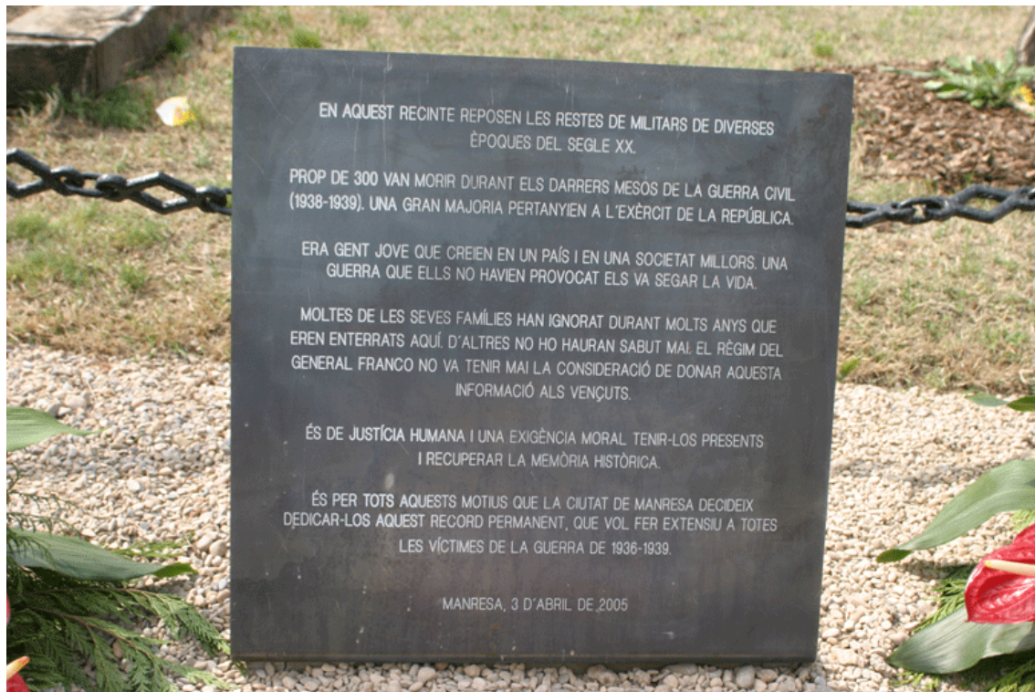
Mass grave in Manresa's cemetery

Franco's dictatorship practiced forms of repression that were to be imitated later by Latin American dictators: concentration camps, executions without trial or summary executions, mass graves, children taken away from their parents and given in adoption or taken to orphanages and treated as outcasts. Sometimes they were taken from their pregnant mothers who gave birth in prison. Women were a particular target for humiliation. Apart from suffering the same fate as men in many cases, they were raped or given castor-oil and taken on parade while they could not stop doing their needs in the street, or simply had their head shaved. According to historian Hugh Thomas, more than 100,000 people were executed after Franco arrived to power, that is, without counting deaths during the war. Many were executed in rows and without trial or after a quick council of war.