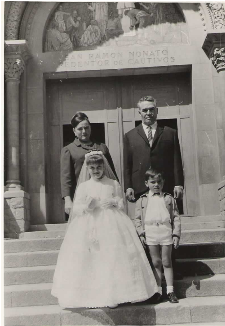
An average family in L'Hospitalet de Llobregat –a migrant area close to Barcelona- in 1968, after a girl received her Catholic first communion

During the 1950s a massive exodus started from the rural areas to the cities, which became much more intense during the 1960s. Populations living in small villages or rural communities went to live in Barcelona, Madrid and Bilbao, or, in smaller numbers, to their provincial capitals. Many people also migrated abroad, particularly to other countries in Europe like Germany or France. The revenues from these migrants to their families in Spain was a flow of money into the country that helped to revitalise the economy.