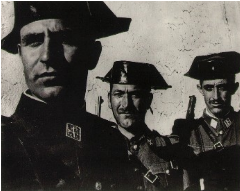
The civil guard was a symbol of the repression under Franco's dictatorship

The political system ruling in Spain from 1939 to 1975 arose from the Spanish Civil War. The Second Republic was an attempt to modernise the country and to substitute the old structures of domination, based in agrarian capitalism, by a modern, democratic and industrial system more in tune with areas like Catalonia and the Basque Country. The old rural oligarchy –landowners of landed states- opposed any change and together with the army and the Church supported the reaction and the military coup leading to the war.