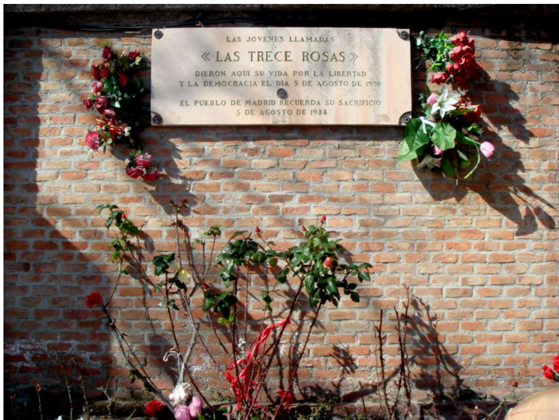
Monument dedicated to the Thirteen Roses in the cemetery of “La Almudena” in Madrid